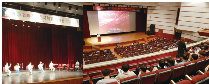
Halla Art Hall