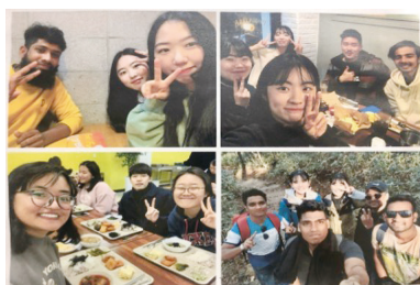
Global Mentor-Mentee Program

We want to make sure you enjoy your stay in Korea. Be sure to take advantage of our wide range of fun activities that help you assimilate to island life and experience all that Korean culture has to offer.