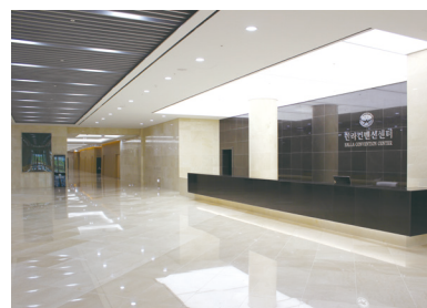
Halla Convention Center