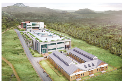
Off-Campus Training Facilities