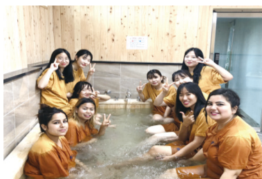
Korean Spa Experience